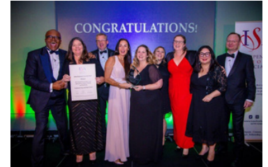
ISA Awards 2023